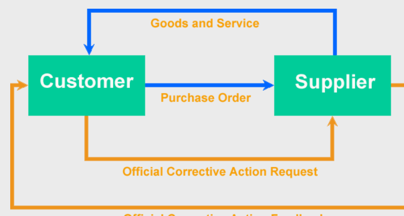
Official Corrective Action Feedback

Recently, one of my clients complained to me when I introduced this supplier management model to him. "...the concept is fine, but only if I can do it... I don't have time for all these works", he said.